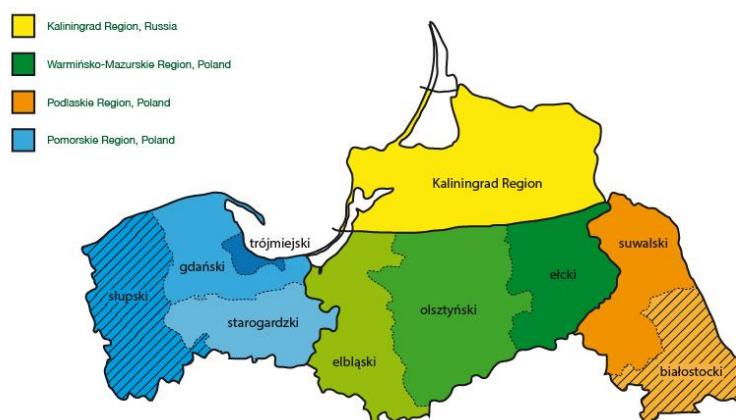
Coverage of the Poland-Russia CBC Programme 2014-2020 by region

Source: Poland-Russia Programme. (2014).